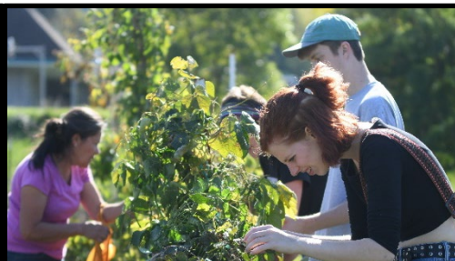
Students in the Edible Activism FIG volunteer at the Huerto de la Familia community garden in Eugene.