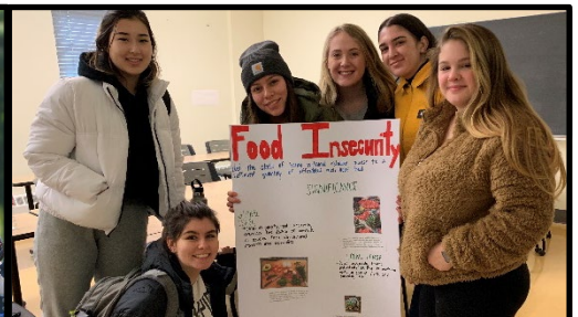
Students in the Human Hierarchies FIG display their final project at the FIGposium.