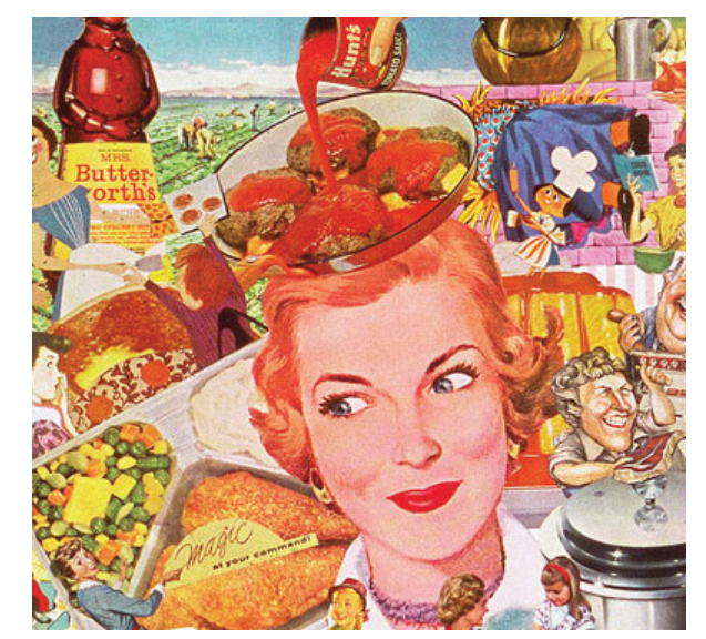
"Cold War Kitchen", Sally Edelstein